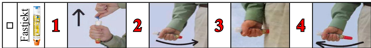
Fastjekt: 1. Hold Fastjekt firmly in the hand and remove the blue cap. 2. Hold Fastjekt with the orange tip facing the outside of the thigh at a distance of 10 cm. 3. Firmly press the auto-injector into the thigh at a right angle until a click is heard, leave Fastjekt in this position for 10 sec. 4. Remove Fastjekt and massage the thigh for 10 sec.

☞ hold the leg still before and during injection to prevent injuries